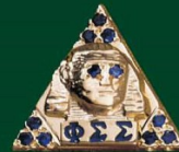
PHI SIGMA SIGMA