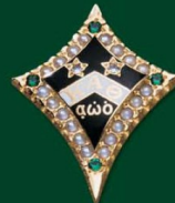
KAPPA ALPHA THETA